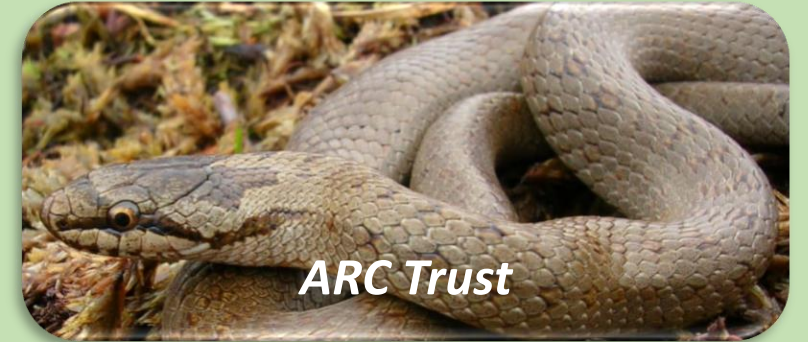
12 Smooth snake