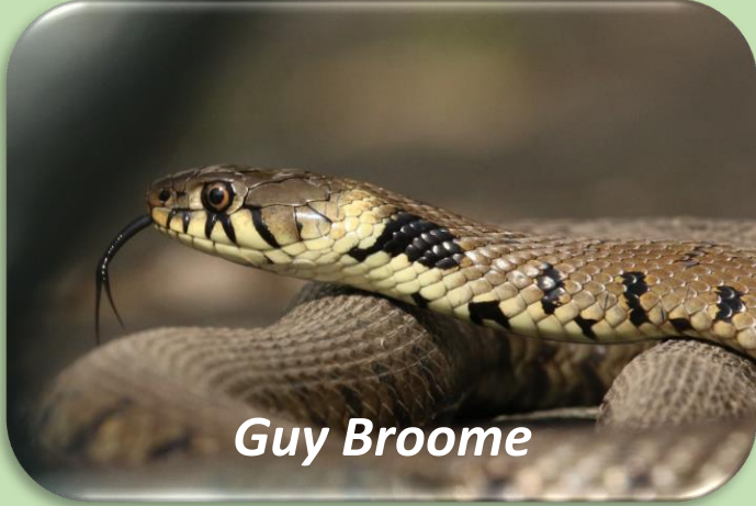
10 Grass snake