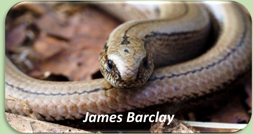
6 Slow worm