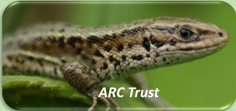
4 Common lizard