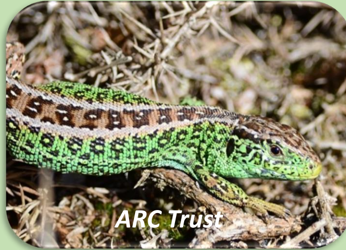
5 Sand lizard