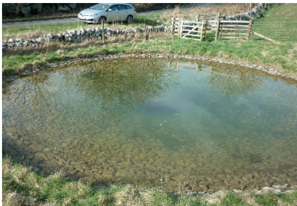
A dewpond in our annual monitoring scheme

A few special surveys were undertaken by members following CIEEM guidance where the work was part of long-term studies or assessing recent conservation work