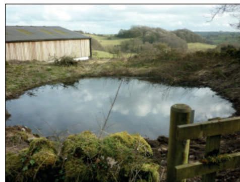
Ballidonmoor dewpond before & after desilting.

Due to the covid-19 restrictions we couldn't organise the planned Derbyshire ARG survey visits but a single torchlight survey in late May to both farm dewponds did find both great crested and smooth newts present plus frogs.